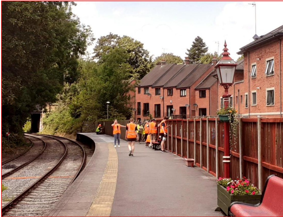
East Midlands Railway Volunteering Day Fence Painting