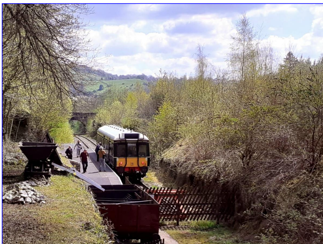
Ravenstor Station with Railcar 55006

Work to spring clean at Ravenstor takes place each year and in April this took in the removal of a fallen tree from the station approach path and clearing of the path from Old Lane to the station; routine but necessary litter picking as far as Cromford Road Bridge; detailed repainting of fencing and facilities; clearance of overgrown vegetation and path repairs. Someone had the gnome away and its a well-known fact that stolen gnomes rot your Petunias, but we are naturally looking for a new one, in the spirit of adornment, for our station.