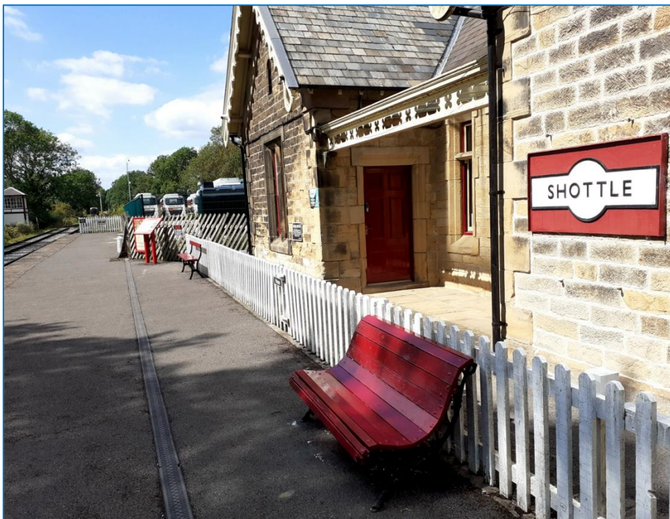
Shottle Platform 1 benches repaired and repainted in burgundy