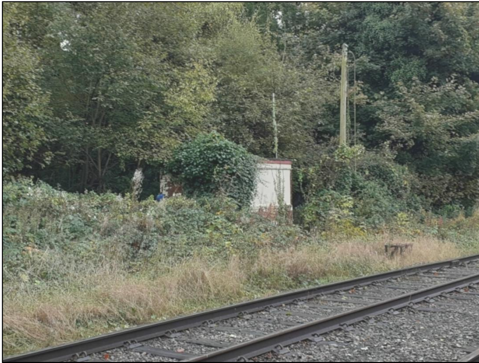
Before restoration in late 2024

through the years of its disuse and as an eyesore, easily visible from passing trains and passers-by on Wash Green Bridge