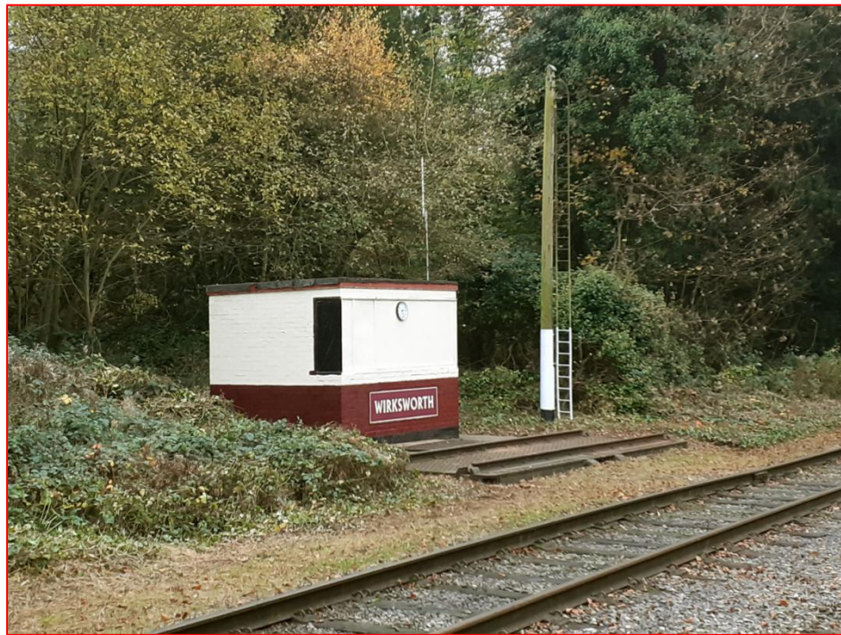
After restoration in early 2025