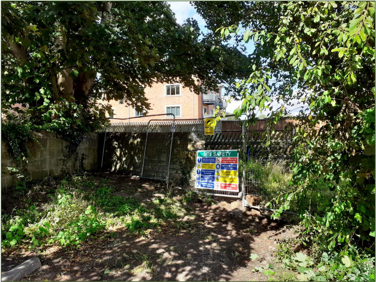
The location of the gate in late 2024