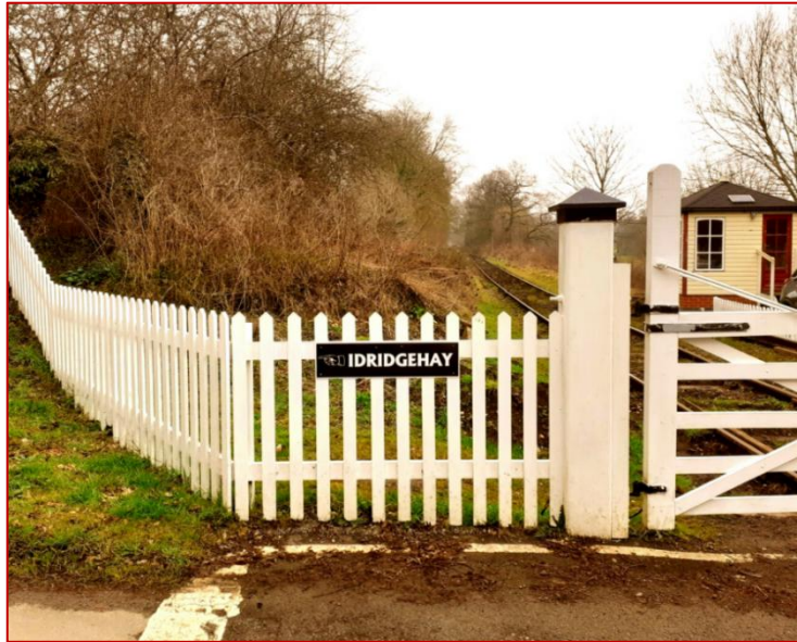
New signage provided at Idridgehay Station by the Trust

The Trust has, over a period of years, been renewing the signage, interpretation and poster boards at a number of our stations and this year new signs were provided by the Trust for Idridgehay at the request of the group which had been formed there to look after that station.