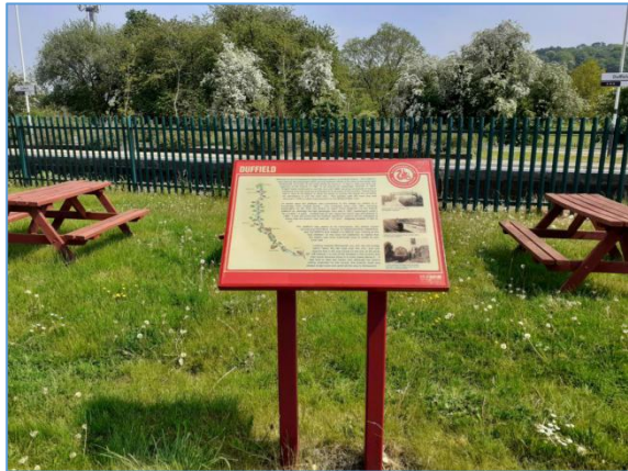
Interpretation Board before and after restoration

The Trust had allocated funds to renew almost all the station signage at Duffield in relation to the gate project, to make the station more welcoming and to comply with Wyvernrail signage standards. This included gate signs, door signs and a new running-in board.