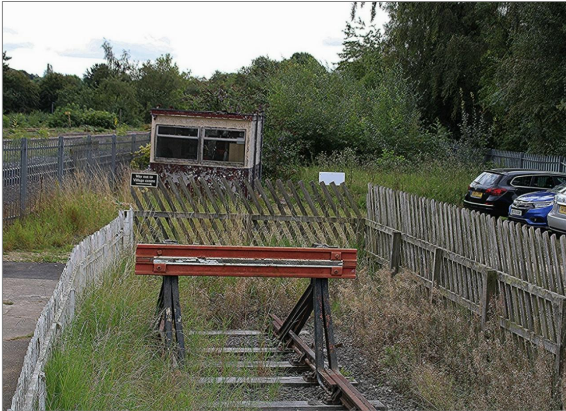
Former Portacabin store at south end before removal