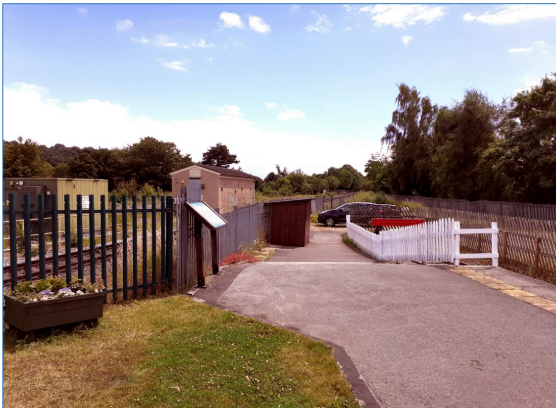
New (to us) repainted store and restored south end of Duffield Station 7 th June 2024