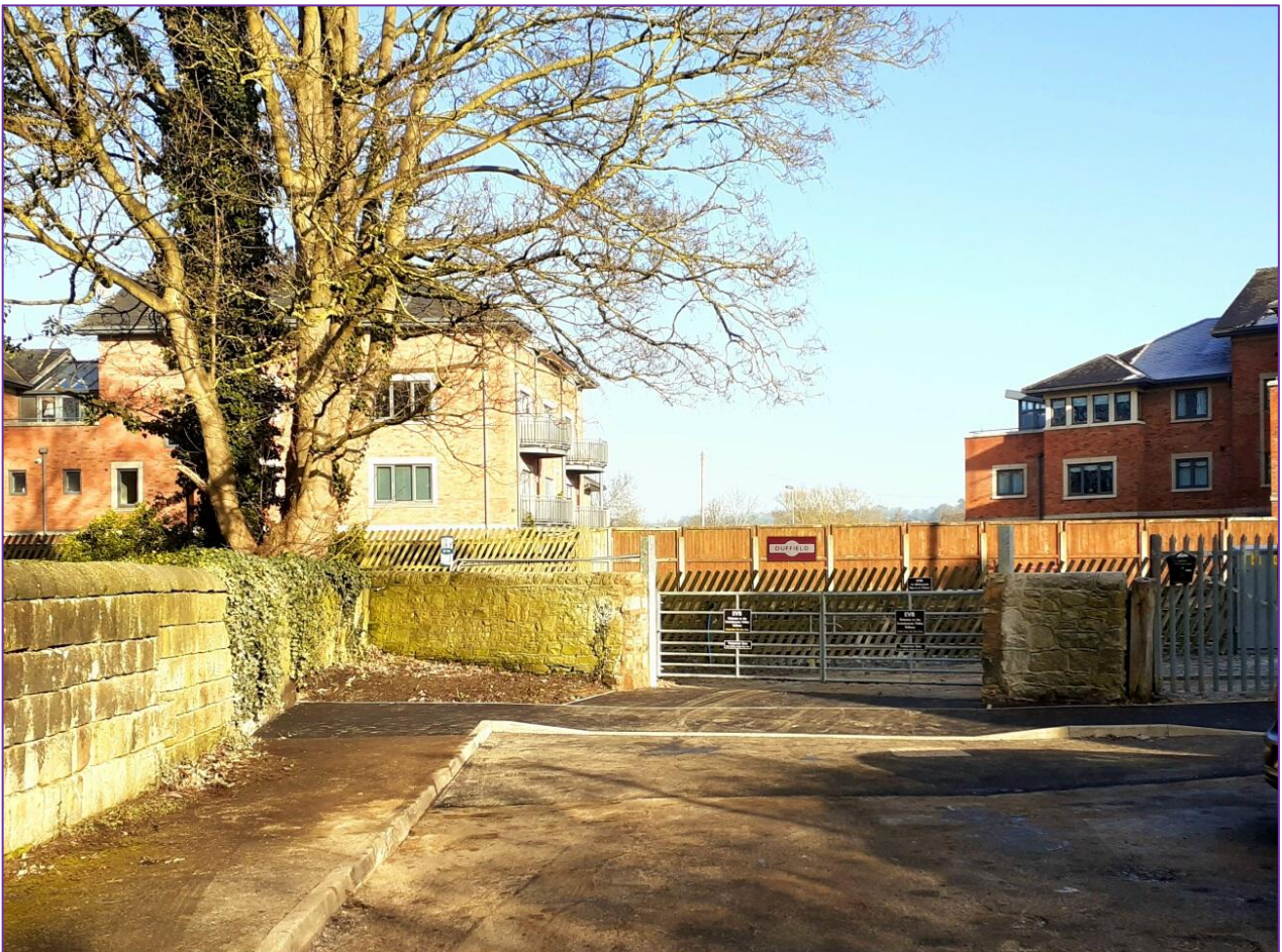
The new gate in January 2025